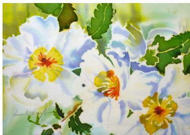
White Beach Roses, Silk by Sue Wierzba

You will paint a beautiful design on a Silk scarf or a Pillow Cover using all professional equipment. We will also make a sun catcher to start our creativity. Sipping is BYO. All materials, frames, equipment, solutions and instruction are included.