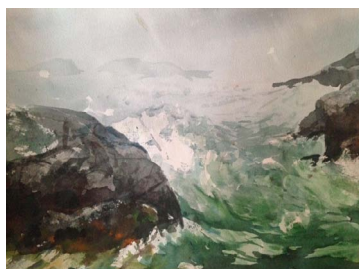
Foggy Morning , watercolor by Dustan Knight