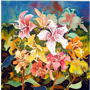
Tiger Lilies by Sue Wierzba

Show Description: Work submitted will evoke the wonder and joy of the fullness of Spring. We will also include floral sculpture and live arrangements. Due to limited space for display, 3 dimensional work should not exceed 14”x14”x14”