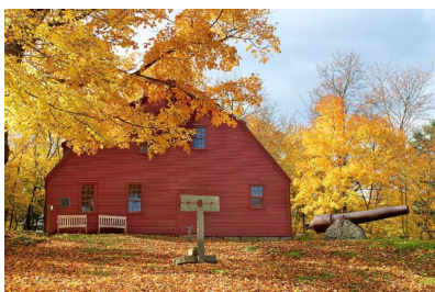
Old Gaol by Robert Taylor

Show Description: The YAA Fiber Group is organizing a project to support our village. All art needs to be of York Village—it could feature its buildings, open spaces, skyline, history, or statues. It can be in any medium but must be 16” X 16” in dimension, including any framing.